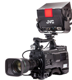
GY-HC900 with optional viewfinder